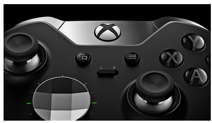
NOTE: The Master Mod features are ONLY available in controller Profile 2

Step 1: Set your Xbox One Elite Controller to controller Profile 2